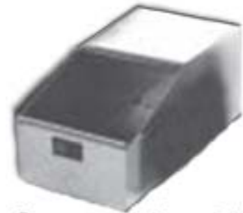
Commercial nest box

towards the top to allow excess heat and moisture to escape. If you use a metal box, use one with a removable wooden bottom. Metal floors are cold and slippery. Metal floors contribute to chilling of the litter and spraddle legs. Don't use them.